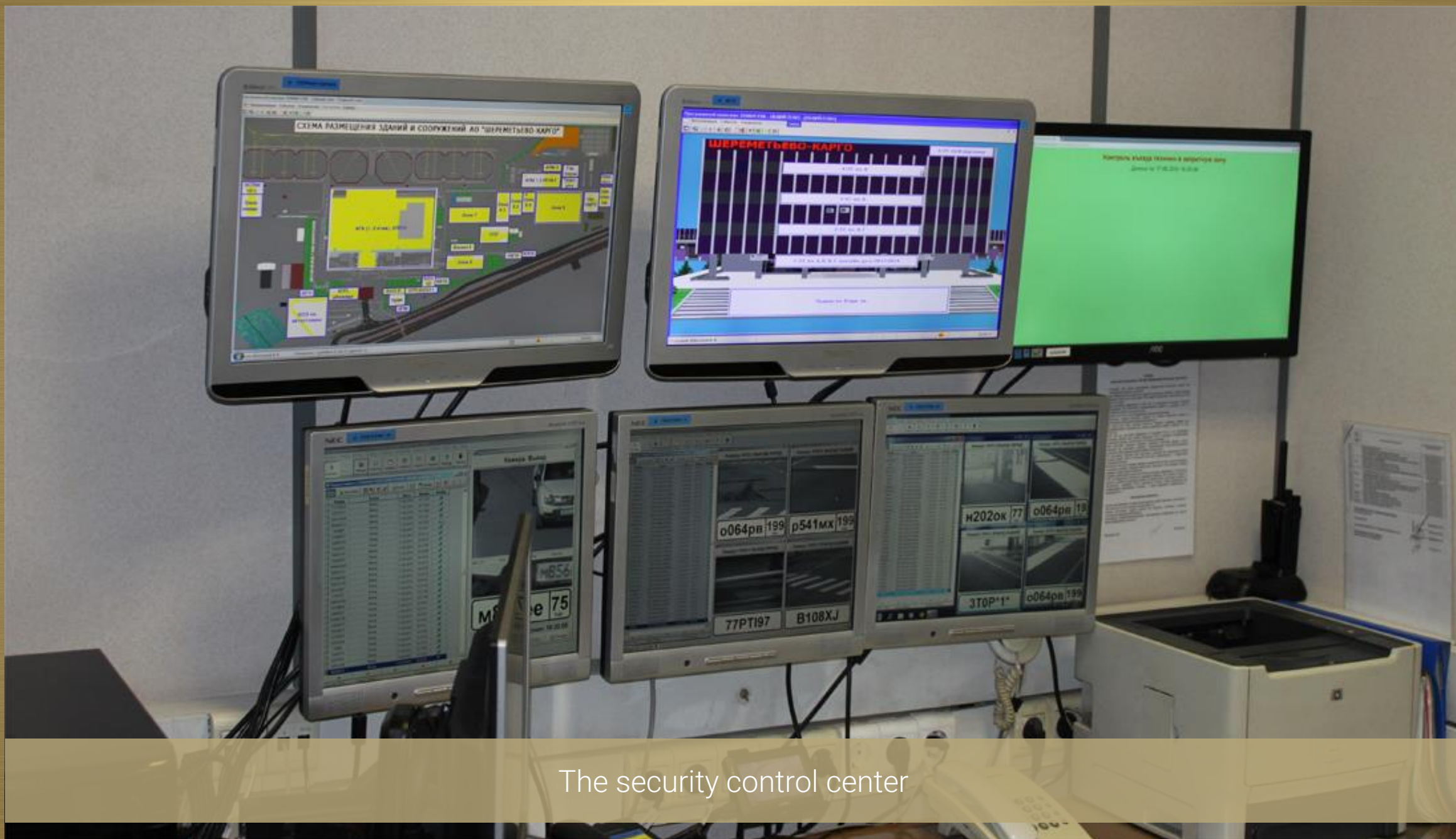
The security control center