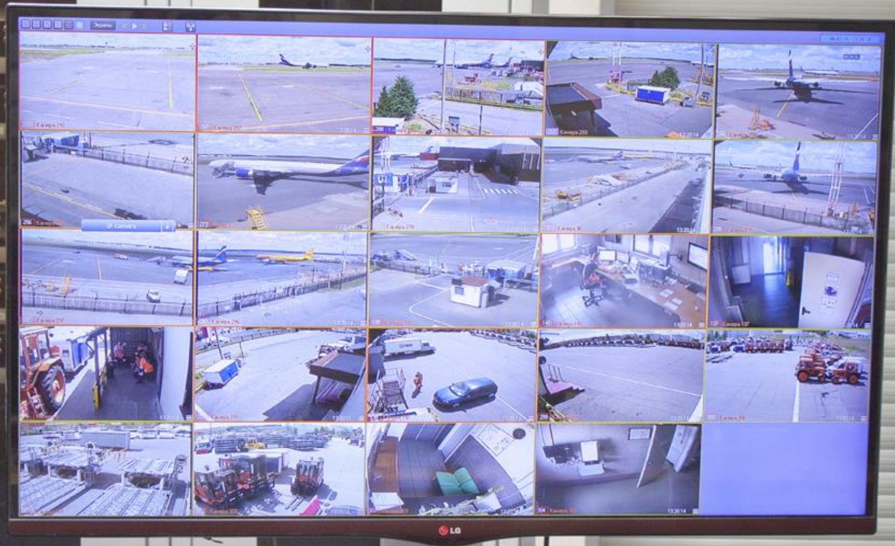
The security control center