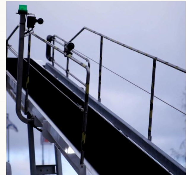
Video recorder on the equipment

This device allows to monitor the handling process online and record video in HD quality