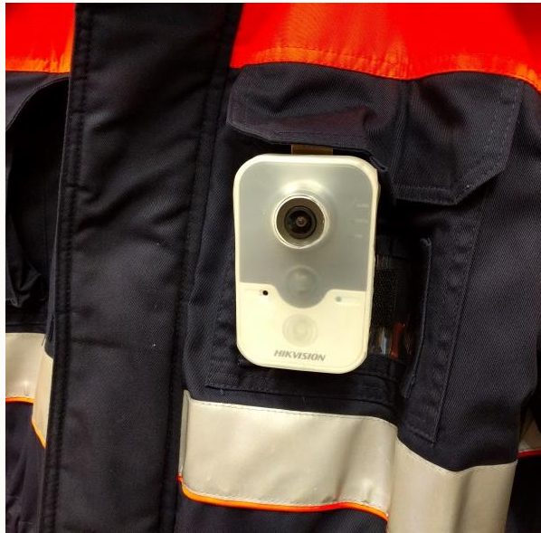
Personal video recorder

Surveillance video from the valuable warehouse is kept at least 30 days