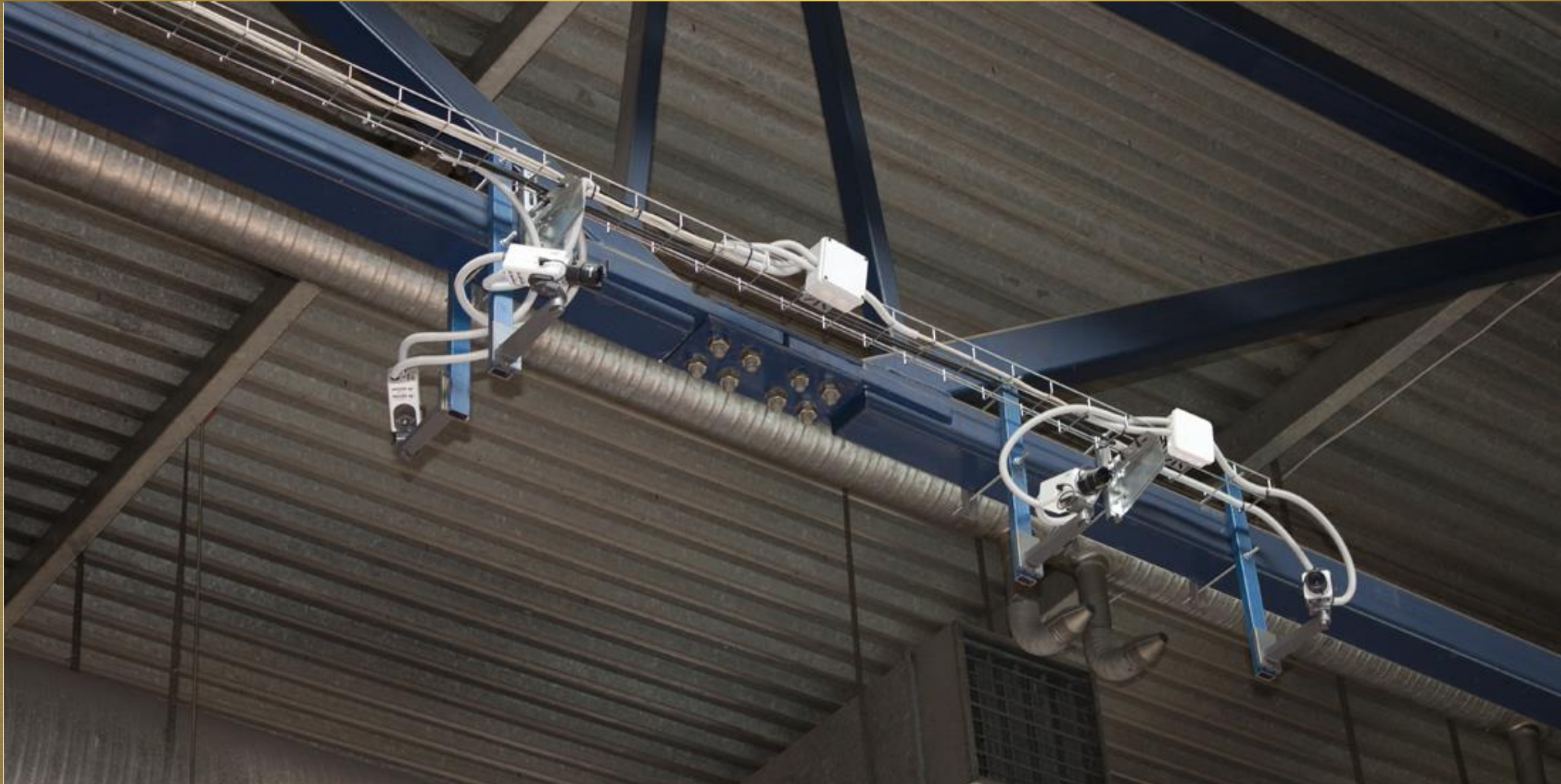
Video cameras at our warhouse